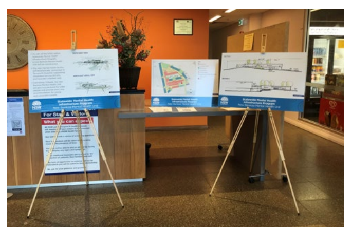
TAMWORTH HOSPITAL POP-UP

During this consultation period, the project team has received a large number of suggestions and feedback related to the design of the new mental health facility. A summary of key feedback themes is included below.