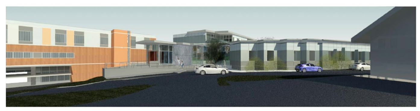
ARTIST IMPRESSION SHOWING THE NEW UNIT WITH TAMWORTH HOSPITAL ON THE LEFT

The project team is committed to delivering a modern and healing mental health facility for the New England North West communities.