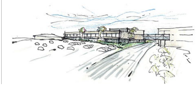
ARTIST IMPRESSION SOUTH WEST VIEW

The new Banksia Unit will have 33 beds, containing additional beds for older people and short stay accommodation for adolescents and people experiencing vulnerability.