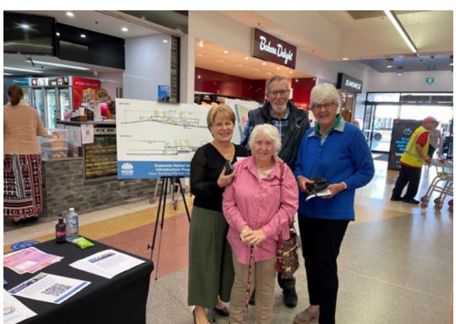
TAMWORTH SHOPPING CENTRE POP-UP

To co-design the new Banksia Unit, the project team has been consulting with a large number of staff, carers and consumers with lived experience of mental illness. We also visited communities in the NSW New England North West, provided an online survey and as of August 2021 we had logged over 370 comments on the draft design for the new Banksia Unit.