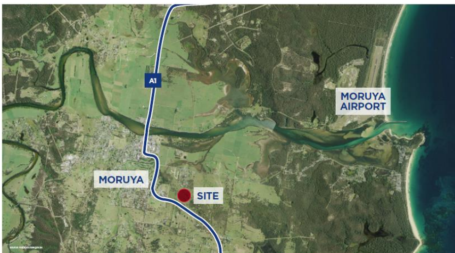
Figure 1: Site selection map

The recommended site has been evaluated against a range of assessment criteria including current and projected population growth areas, flood and bushfire zones, capacity for future expansion, transport, and access to and from key infrastructure such as Moruya Airport and the planned Moruya Bypass. For updates on the Moruya Bypass project please visit the project website: www.rms.nsw.gov.au/projects/moruya-bypass .