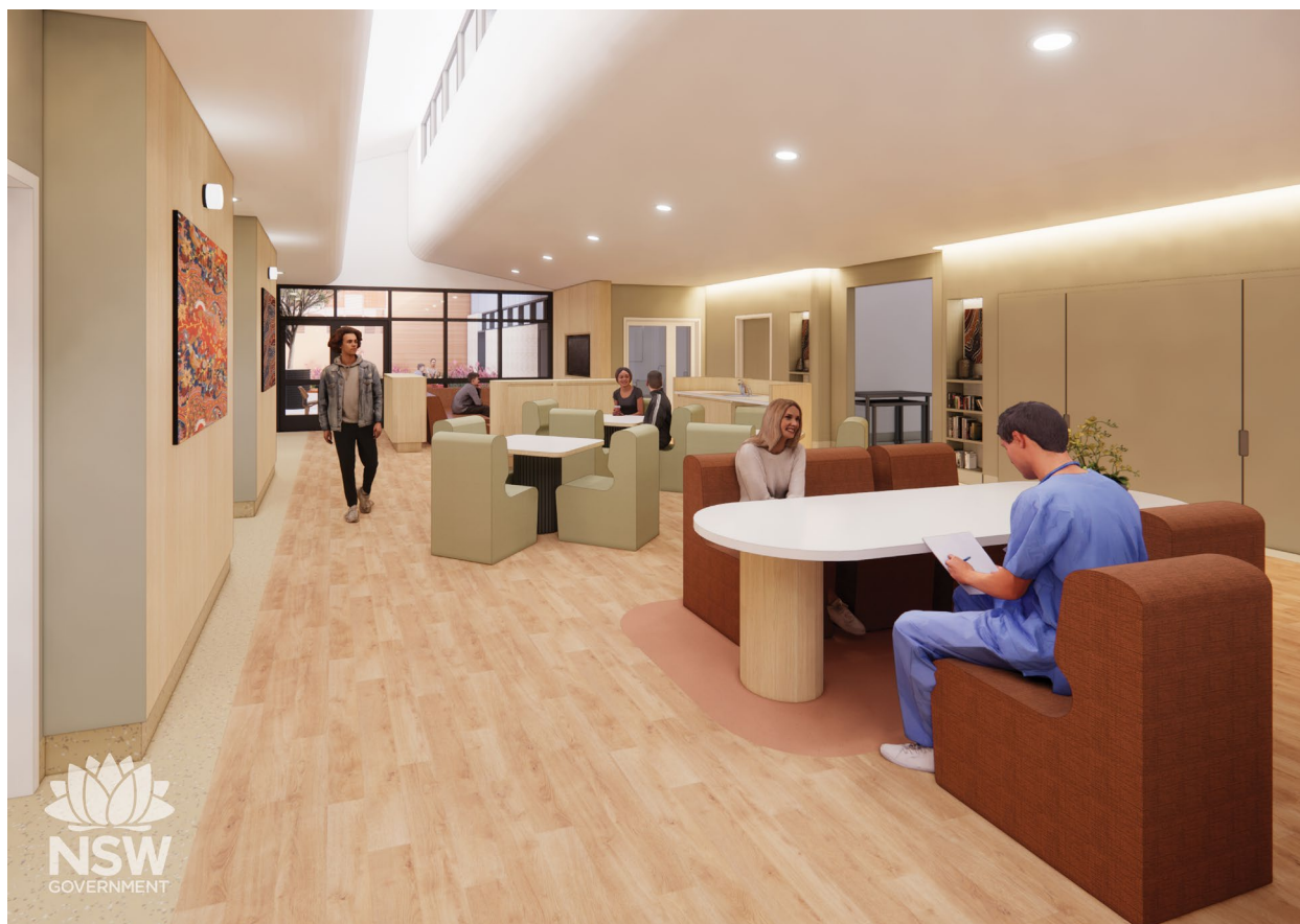
ARTIST'S IMPRESSION SCHEMATIC DESIGN ACUTE MHIPU: MAIN LOUNGE/DINING

The design has been informed by valuable feedback from staff, clinicians, consumers, carers and the community, including Aboriginal people.