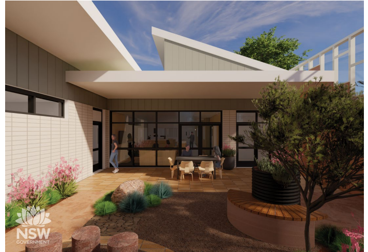
ARTIST'S IMPRESSIONS SCHEMATIC DESIGN ACUTE MHIU: INPATIENT ROOM AND COURTYARD