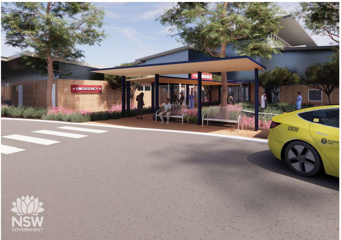
ARTIST'S IMPRESSION CONCEPT DESIGN EMERGENCY DEPARTMENT: DROP-OFF AND NEW ENTRY

The Schematic Design for the ED is expected to be released shortly following consultation on the Concept Design.