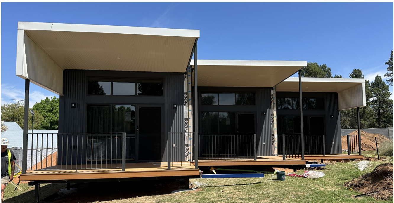
The three units delivered on site at Narrandera Health Service, with infrastructure connection works now in progress.

Narrandera Health Service is the third of four sites in the Murrumbidgee Local Health District (MLHD) to have key worker accommodation units installed under the NSW Government's $45.3 million Key Worker Accommodation (KWA) Program. The KWA Program is being delivered in partnership between Health Infrastructure and the MLHD.