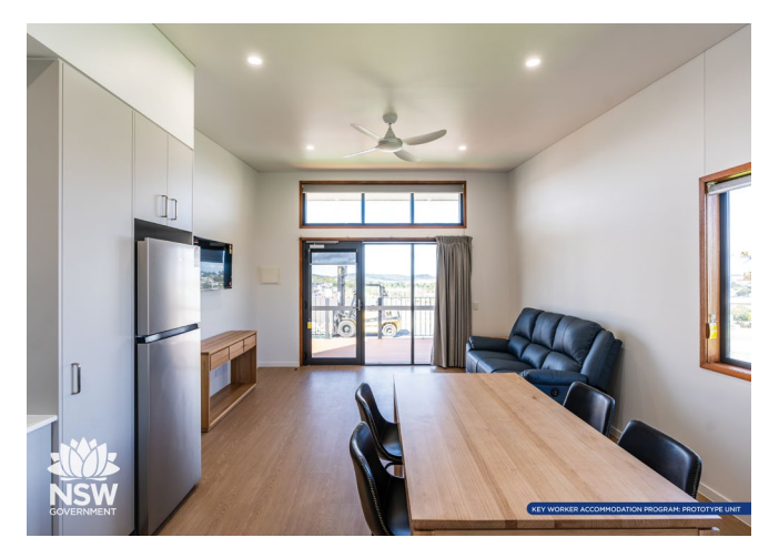
Example of the living and dining area in the units