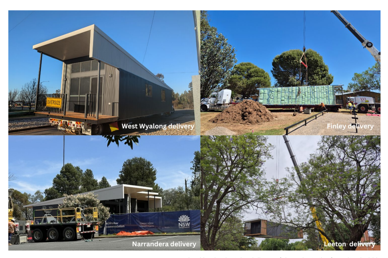
Looking back at the delivery of the units to the four sites in 2024