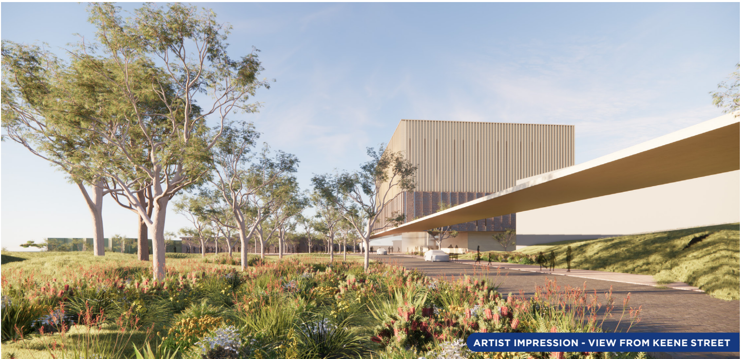
ARTIST IMPRESSION - VIEW FROM KEENE STREET