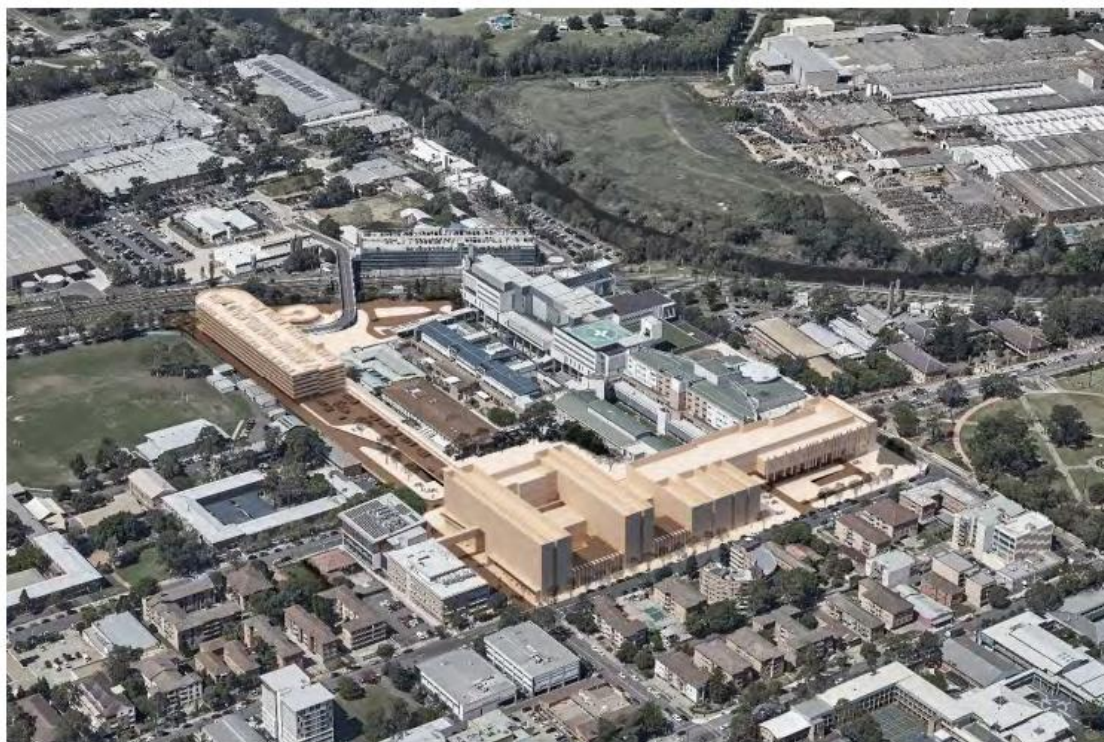
Figure 2 - Proposed development 3D aerial image

Liverpool Hospital is located within the Liverpool Central Business District (CBD), on the corner of Elizabeth Street and Goulburn Streets, Liverpool. The hospital campus includes land east and west of the Main Southern Railway, which forms an eastern and western campus. The proposed works are located in the western portion of the western hospital campus.